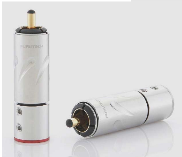
FT-111 (G) RCA Connector

Furutech makes a wide variety of OEM parts known the world over for their quality construction and superb sound. Our engineers examine every part of the signal and power path no matter how small and optimize each and every connection.