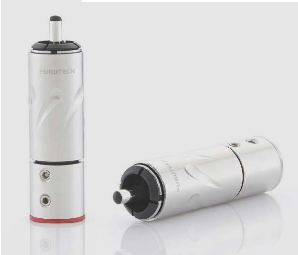
FT-111 (R) RCA Connector